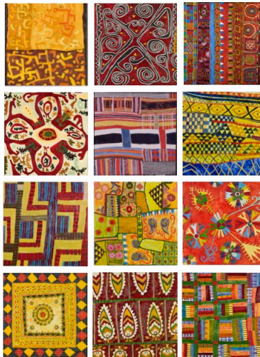
Barbara Ellmann, WHEREWITHAL , 2011, encaustic on 12 wooden panels, 102 x 76 inches (overall).

Summit, NJ: Textility is an exhibition that explores the inventive ways contemporary artists employ materials, concepts, and processes associated with textiles to convey their ideas. Many artists today are producing paintings and sculptures that resemble or reference textiles, using traditional materials like paint, canvas, wood, paper and glass. Other artists are appropriating materials and techniques traditionally associated with fiber or textile arts—cloth or thread, crochet or embroidery, for instance—and using them to convey elements like color and line. And some artists are creating work that suggests fabric or textiles to incorporate a sense of the woven, knotted or stitched. Textility , a group survey of 28 artists, will examine art that draws from and is immersed in this textile sensibility.