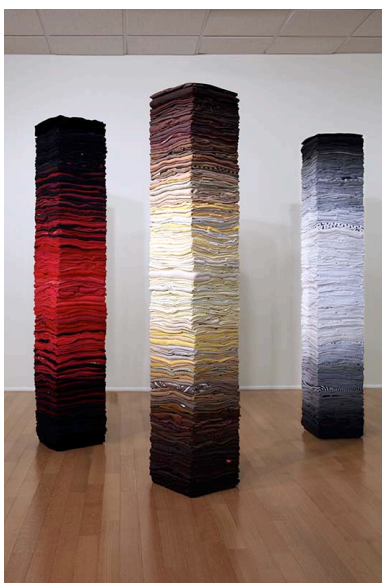
Derick Melander, The Painful Spectacle of Finding Oneself , 2010, second-hand clothing, wood and steel, 72 x 12 x 12 inches (each). Courtesy of the artist.

Opening Reception: January 13, 6:00 pm- 8:00 pm